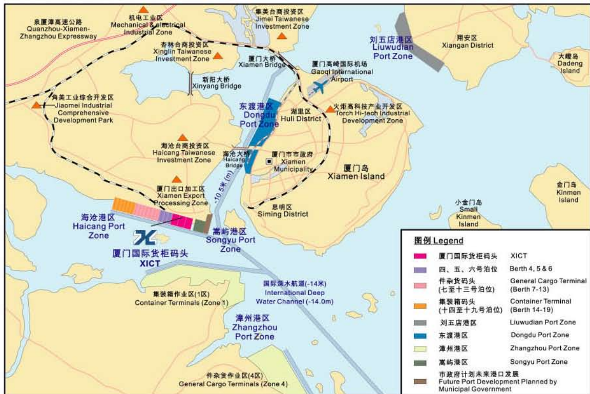
厦门国际货柜码头位置图 Location map of XICT